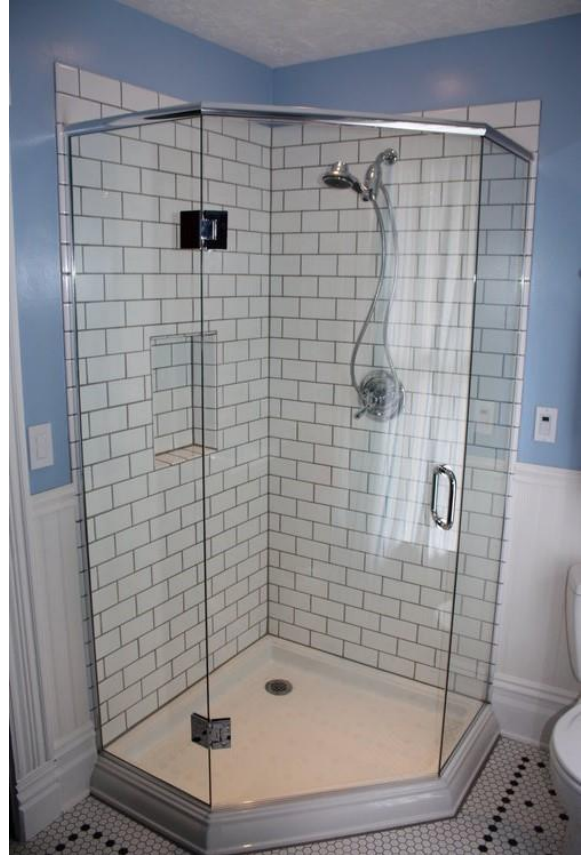
Neo angle used for a small space

A neo angle shower is any layout where the walls meet at 135° angles instead of standard 90° corners. The specifics about how wide the walls are, where the door is located, and every other design detail can vary from bathroom to bathroom, just like any other shower layout.